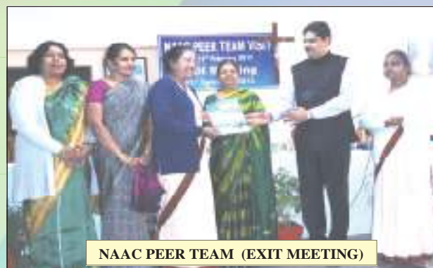
NAAC PEER TEAM (EXIT MEETING)